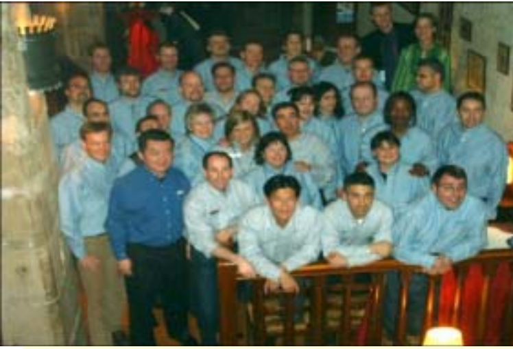
Winning entrepreneurs are products of a team.