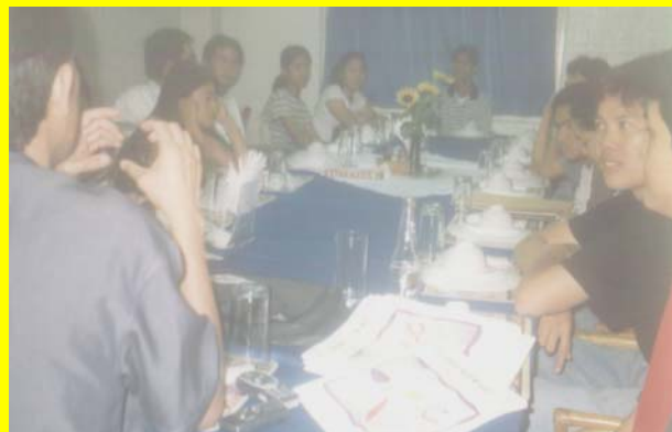
The General membership approves the "MAD of Jaycees" Project insula Jaycees of Virginia, USA.

website was later on linked to the city of General Santos, the Philippine Jaycees, the Junior Chamber International, and lately, with the website