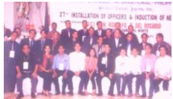
The new set of officers of Greater Davao Jaycees with the Twin Star Jaycees.

The Peninsula Jaycees board would like to thank again everyone who helped out and attended this first year event!